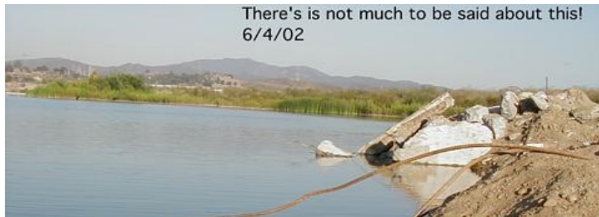
There's is not much to be said about this! 6/4/02